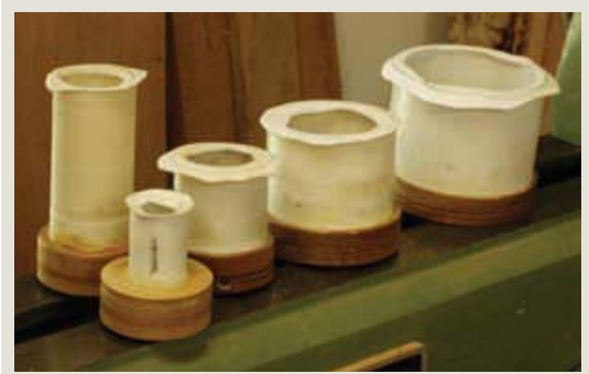
Assortment of vacuum chucks ready to use.

32 American Woodturner Summer 2009 woodturner.org 3