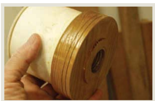
Bottom view of completed vacuum chuck

Cliff Hill is a retired aerospace engineer who lives in coastal North Carolina.